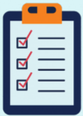
Daily Health Screening

Read more about MMC's health and safety guidelines here.